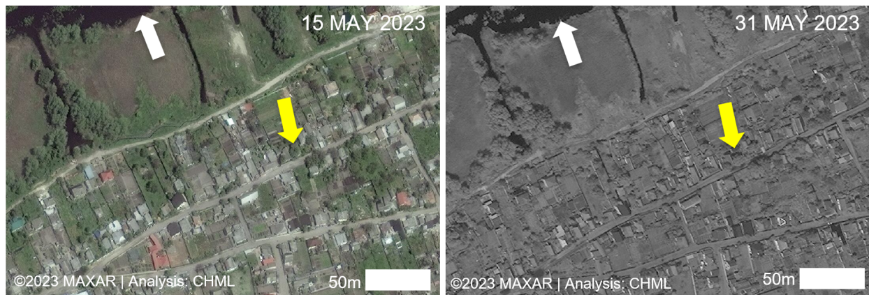
Images 1–2. On the left, a satellite image of the Polina Raiko House Museum (yellow arrow) on 15 May 2023 shows the waterline (white arrow) prior to flooding. On the right, a satellite image of the museum (yellow arrow) on 31 May 2023 also shows the pre-flood waterline (white arrow).

Findings: Preliminary analysis using available high-resolution satellite imagery confirms flooding near the Polina Raiko House Museum.