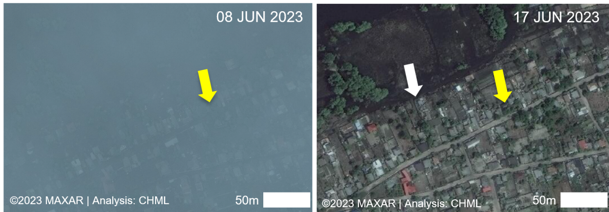
Images 5–6. On the left, a satellite image from 8 June 2023 shows the Polina Raiko House Museum (yellow arrow) and surrounding area still inundated. Visibility in this image is lower due to cloud cover; however, water can be identified surrounding the museum. On the right, a satellite image of the museum (yellow arrow) on 17 June 2023 shows that the waterline (white arrow) had receded north of the museum.

This monitoring effort uses cultural heritage inventory data developed by the Ukrainian Heritage Monitoring Lab (HeMo) in Ukraine, the Smithsonian Cultural Rescue Initiative (SCRI) at the Smithsonian Institution, the Cultural Heritage Monitoring Lab (CHML) at the Virginia Museum of Natural History, and the Center for International Development and Conflict Management (CIDCM) at the University of Maryland under the Cultural Heritage Site List (CHSL) data standards developed by the Penn Cultural Heritage Center (PennCHC) at the University of Pennsylvania Museum with National Science Foundation Grant #1439549. Support was provided by the Bureau of Conflict and Stabilization Operations at the U.S. Department of State. Views expressed in this report represent those of the authors alone and do not necessarily reflect the views of the U.S. government. Learn more at https://conflictobservatory.org . Visit https://www.heritage.in.ua/ for information on HeMo, https://www.vmnh.net/research-collections/chml for information on CHML, https://culturalrescue.si.edu/ for information on SCRI, https://cidcm.umd.edu for information on CIDCM, and https://www.penn.museum/sites/chc/ for information on the PennCHC.